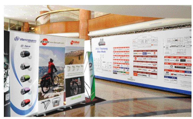
▲ The first floor lobby of the Evergreen Laurel Hotel offered vendors ample space for informative displays.

showed growth in the number of buyers: 350 professional buyers from around the world attended in 2011, and 450 came in 2012.