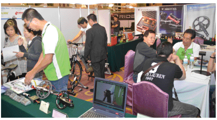
▲ Taichung Bike Week gains more momentum every year. Booths were packed with visitors and buyers from around the world.