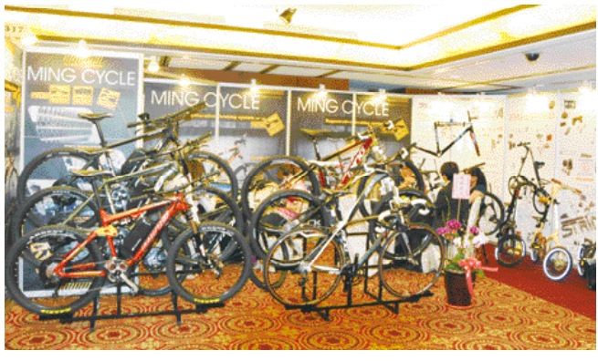
▲ Some assemblers also participated in Taichung Bike Week. Ming Cycle had ▲ The ISPO-sponsored TBW Happy Hour was a very lighthearted affair. a huge display of products at the Splendor Hotel.

The Ride On event, which included about 15 brands led by industry giant FSA, also posted impressive numbers. Ride On events were held at Hotel One and the Nanshan Education & Train-