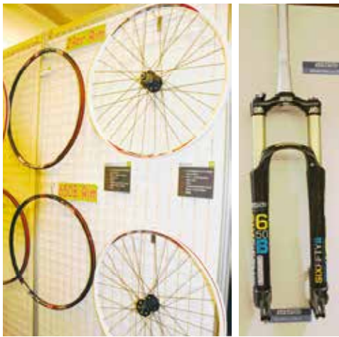
▲ 650B products were hot at TBW 2012. Pictured: 650B rims from WTB (left) and Jetset (middle), and the newest 650B fork from SR Suntour (right).

which is compatible with most 11speed drivetrain systems.